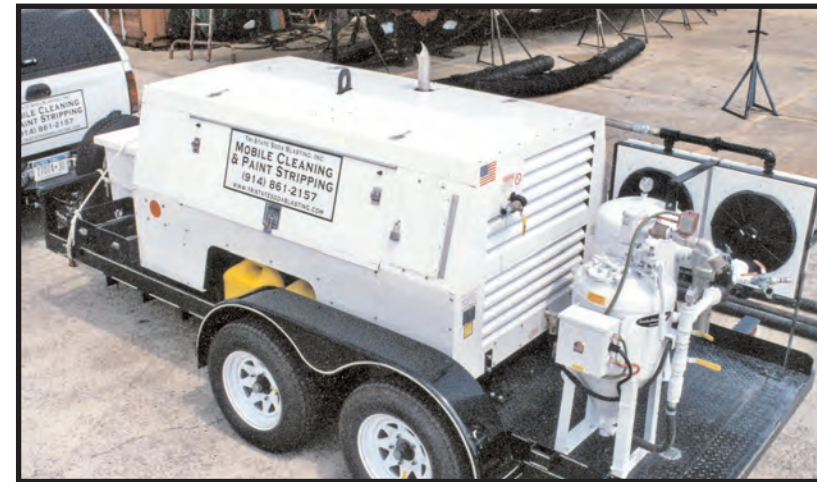
Tri State Soda Blasting Mobile Unit

Soda Blasting is a revolutionary cleaning technology that uses a non-destructive abrasive and eliminates environmentally hazardous chemicals.